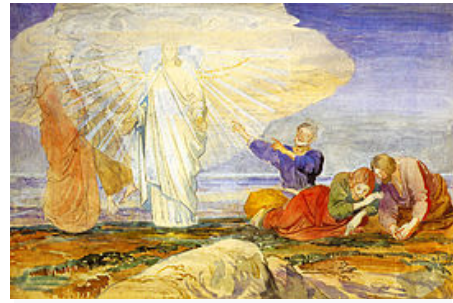
Transfiguration by Alexandr Ivanov, 1824

In the Anglican Catholic Church we celebrate the Transfiguration of Our Lord on 6 August ( Book of Common Prayer, Pages 247-249 ). The event in which Jesus' appearance is transformed and becomes radiant light is recorded in the Synoptic Gospels and is referred to by Peter in his Second Letter and alluded to in the First Chapter of John's Gospel.